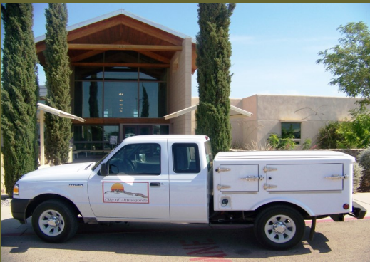
Meals on Wheels Hot Truck

If you would like more information, please call the Meals-on-Wheels Office at 439-4150.